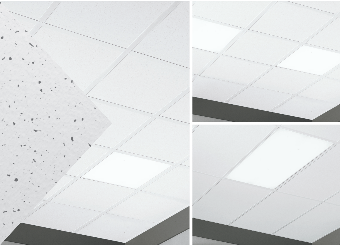
▲ Clean Room™ FL panels with Clean Room 15/16" suspension system

CAD/Revit® drawings at: armstrongceilings.com/cadrevit