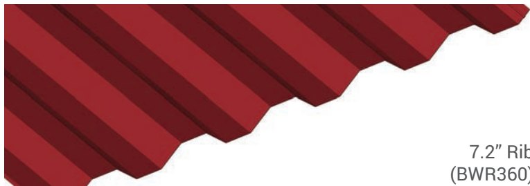
7.2" Rib (BWR360)