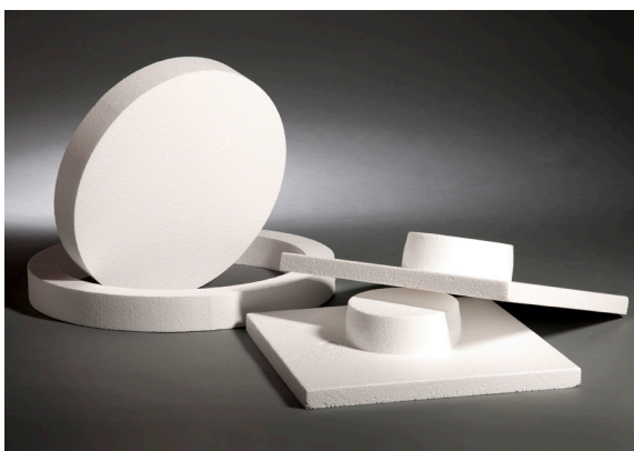
Shown above are protective packaging solutions to prevent costly damages to merchandise during shipment.

Atlas EPS understands that in a manufacturing environment your process depends on our products performing the same day after day, year after year. Each manufacturing facility uses state of the art vacuum molding technology to assure the most consistent materials, proprietary cutting technology to deliver precise thickness, and customized packaging to fit your manufacturing needs. Density and recycle content combinations are discussed so we fully understand the critical aspects of your product, and product codes assure the same agreed material type is used each time. This is Integrity®.