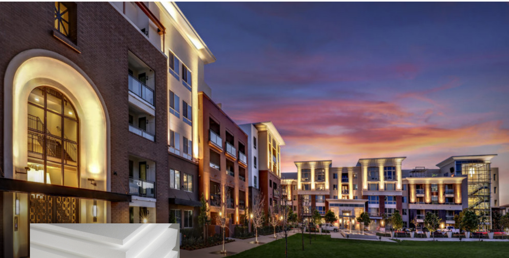
ThermalStar Below Grade Insulation Board

FOUNDATION WALL | UNDERSLAB | COLD STORAGE