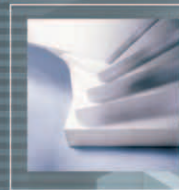
Tapered EPS Insulation