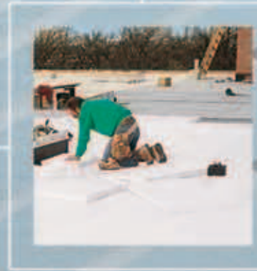
Expanded Polystyrene Insulation