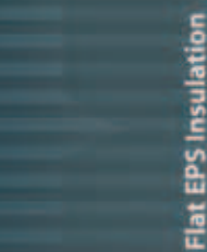
Flat EPS Insulation