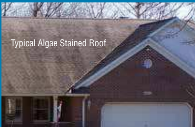
Typical Algae Stained Roof

When black algae streaks take over, not only does it look terrible and make your house appear old and dirty, but also reduces the curb appeal and value of your home.