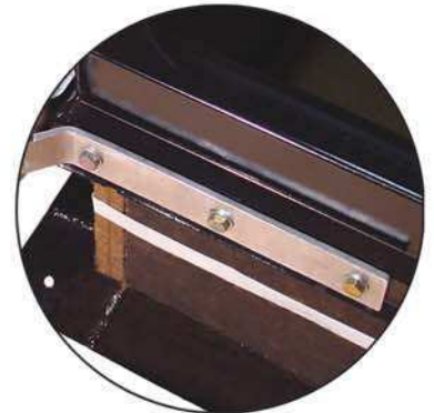
Quick-Mount Bracket For fast, secure attachment