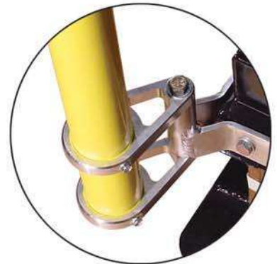
Pivoting Mounting Sleeve For installation flexibility