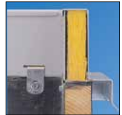
Job-Built Wood Curbs