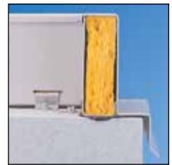
Job-Built Concrete Curbs