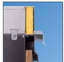
Existing Roof Hatch or Job-Built/Prefab Metal Curbs