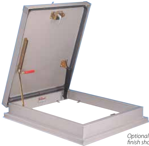
Optional anodized finish shown