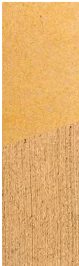
HARVEST GOLD AS-800