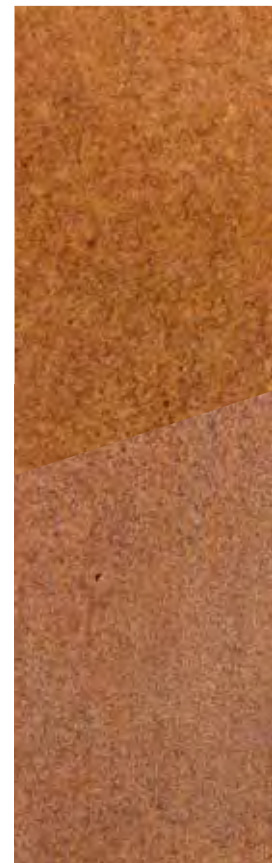
AGED WALNUT AS-1000