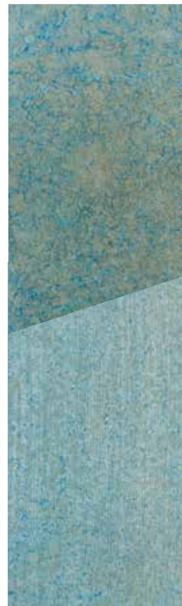
DEEP SEA AS-900