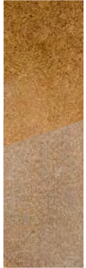
DRIED THYME AS-1700