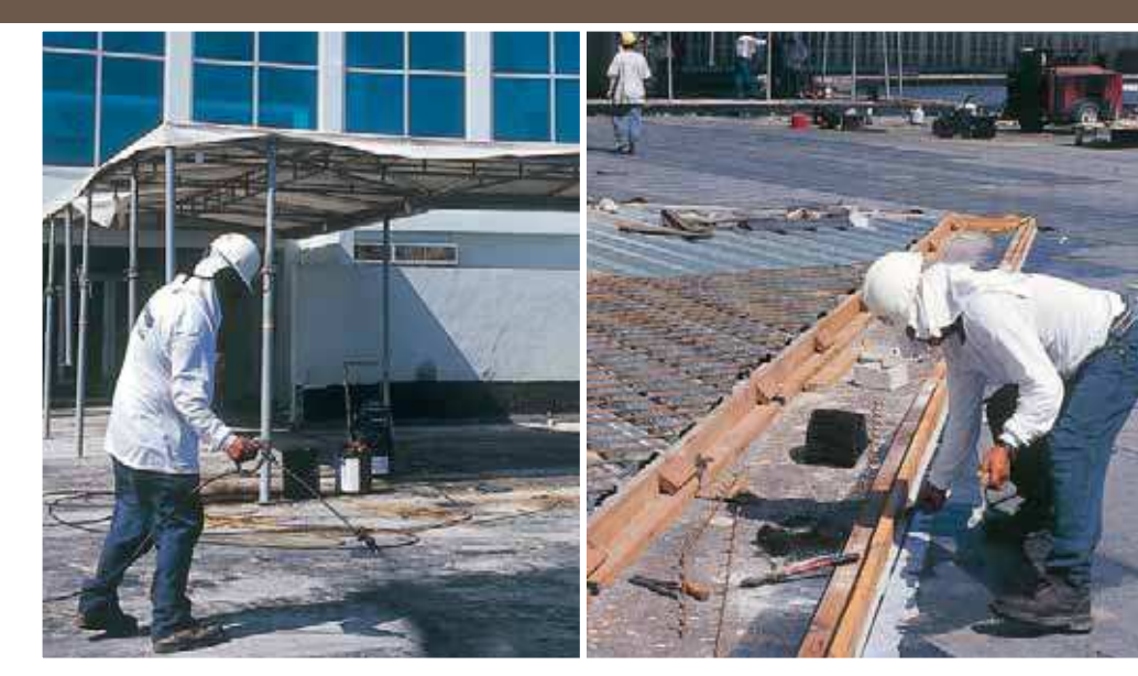
While applicators are busy coating one segment of the concrete roof, a worker lays down a coat of primer with an airless sprayer on another section ( above left ). Elsewhere, a worker applies caulking to a vertical transition that will become part of a raised planter ( above right ).

quickly, there's no time to stop and measure the thickness. "The way you regulate thickness is to keep track of how many buckets you're pouring on a specific area," said Kopecki. "You can't use a notched trowel or squeegee to regulate thickness because the rubber is too viscous, so the guy at the other end of the squeegee knows how much product it will take over a certain area to achieve the mils in the specs. On larger projects we can use a grid system if we need to keep track of the thickness."