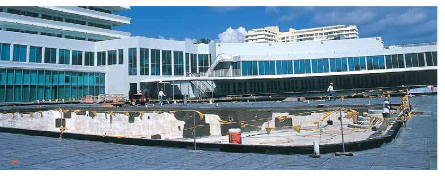
With the pool deck nearly ready for bricklayers, Pro-Tech crewmembers work to ready the area for a leak test — in this case, complete immersion in four inches of water for 48 hours. The rubberized asphalt decking system passed with flying colors.

Although time might be saved by pumping — rather than carting and carrying — the hot liquid from the kettle to the remote reaches of the 53,000-square-foot roof, and there are kettles with pumps available, Pro-Tech