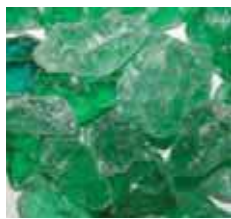
Tree Frog Green