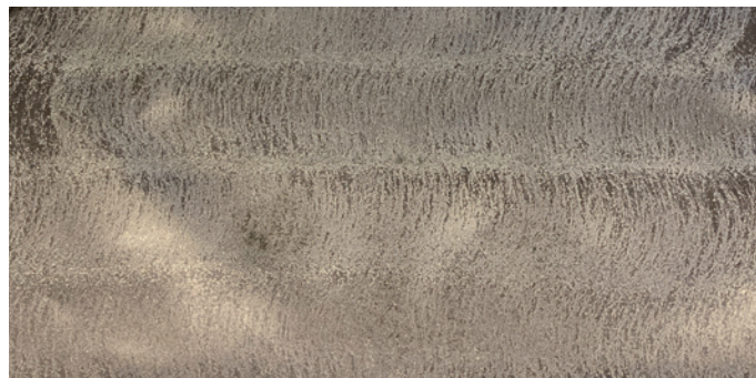
Proper Coverage on Membrane