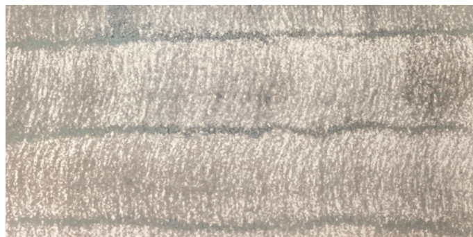
Proper Coverage on Insulation