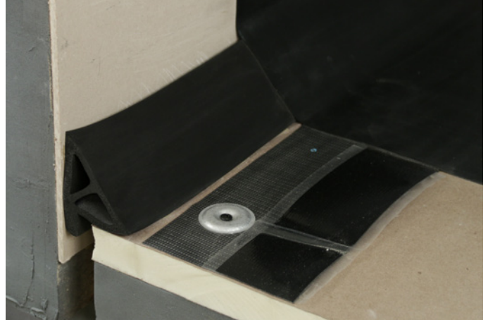
Edge Expansion Joint: Part Number 300471