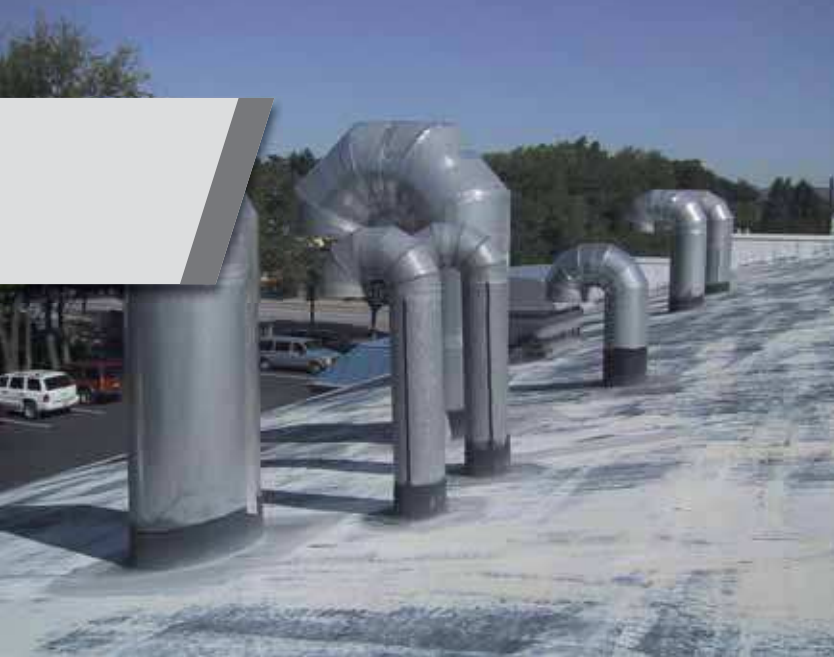
Before: Overview of existing 39-year-old Carlisle roofing system.