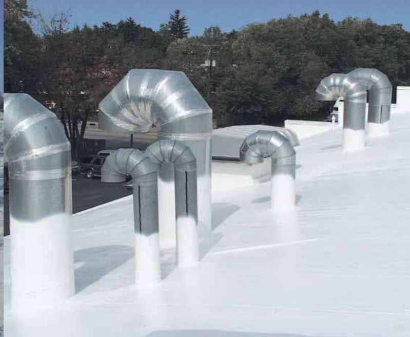
After: Completed restoration.