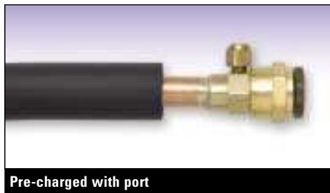
Pre-charged with port