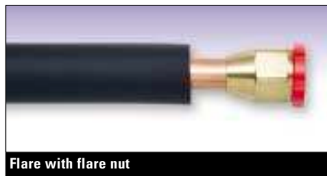
Flare with flare nut