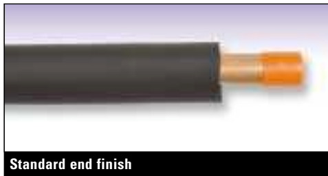
Standard end finish