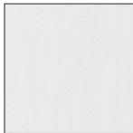
WHITE CRF CRF-1