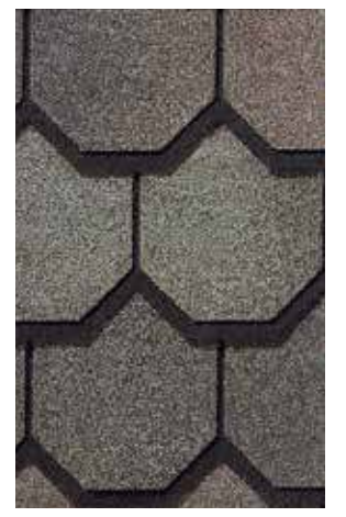
Colonial Slate Gatehouse Slate