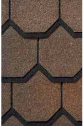
Black Pearl Brownstone