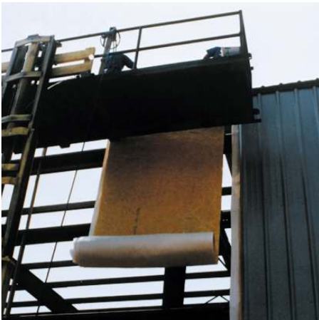
Metal Building Insulation