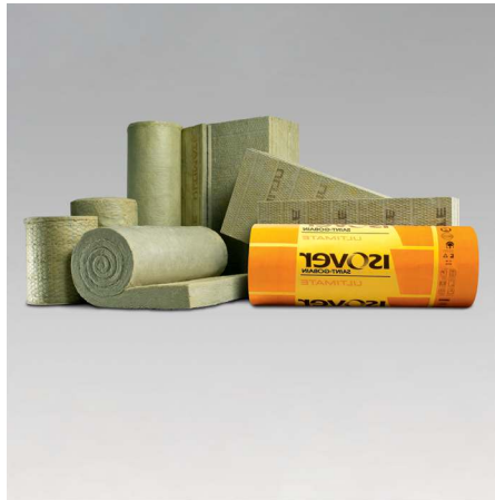
Marine & Industrial