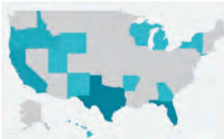
For details on programs in your area, visit www.dsireusa.org .

Even if a particular state or local municipality doesn't require a cool roof, some power companies may offer rebates for qualified roofing products. Additionally, voluntary green building rating programs including LEED® and Green Globes® give credit toward building certification for installing a cool roof product meeting the minimum SRI (solar reflectance index) threshold.