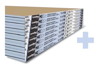
CertainTeed M2Tech Gypsum Board

M2Tech systems protect against moisture and mold in a lower cost system solution versus paperless products. These systems promote healthy indoor air quality when used in new construction and renovations over wood or steel framing in dry areas or areas with limited water exposure.