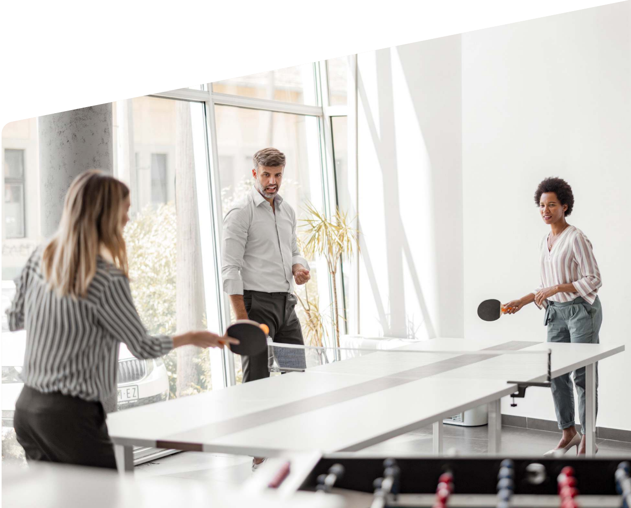
Abuse and impact-resistant drywall is ideal for high traffic areas, or where damage-prone activities occur.