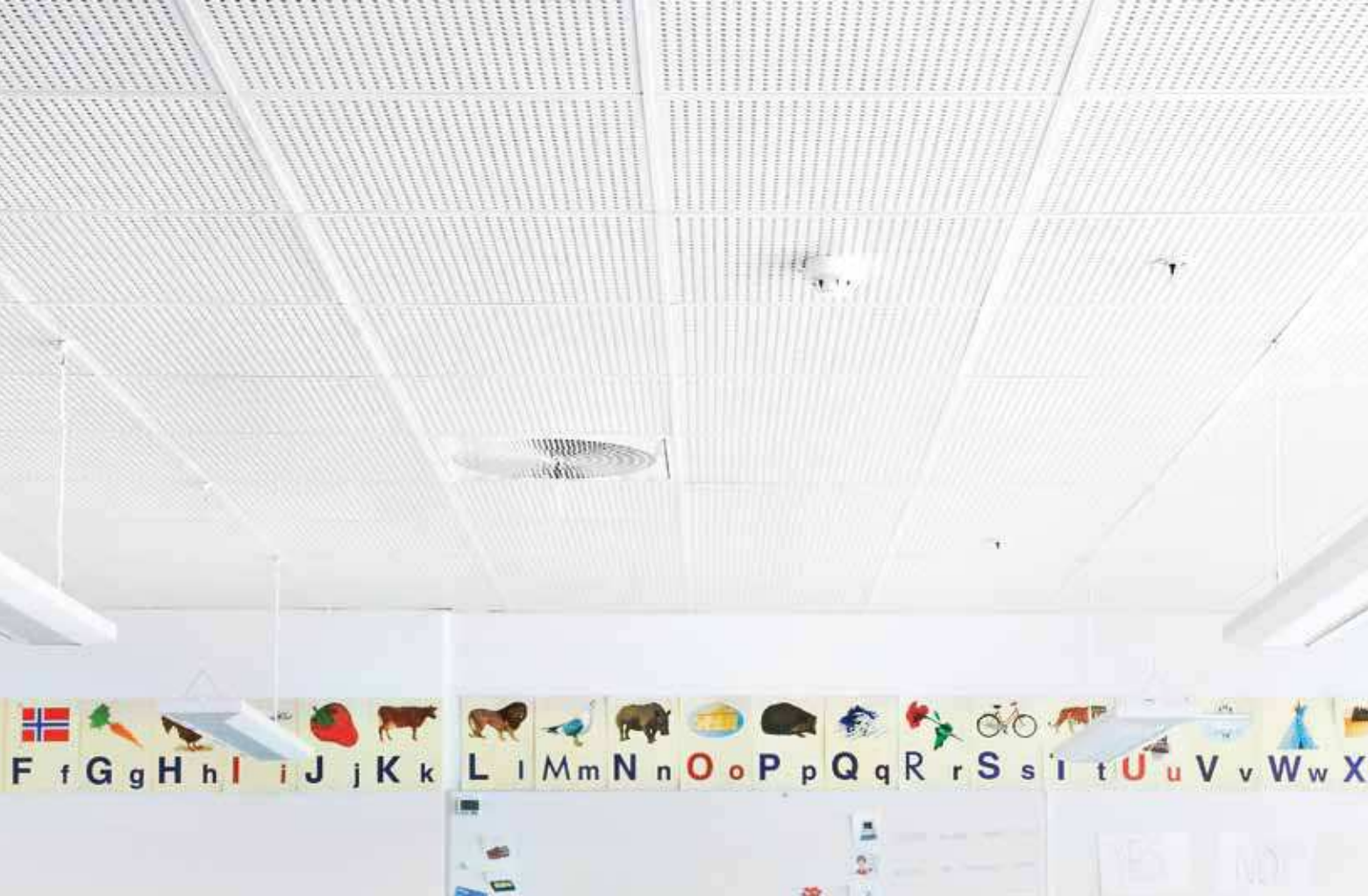
Sixto 60™ Trim