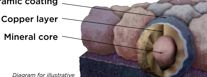
Diagram for illustrative purposes only.