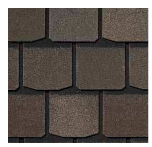
Max Def Weathered Wood