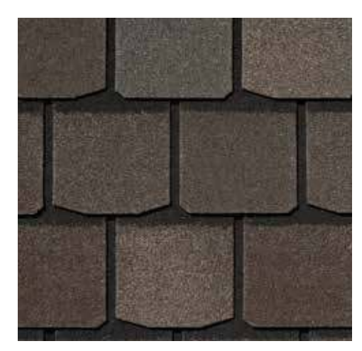
Max Def Weathered Wood