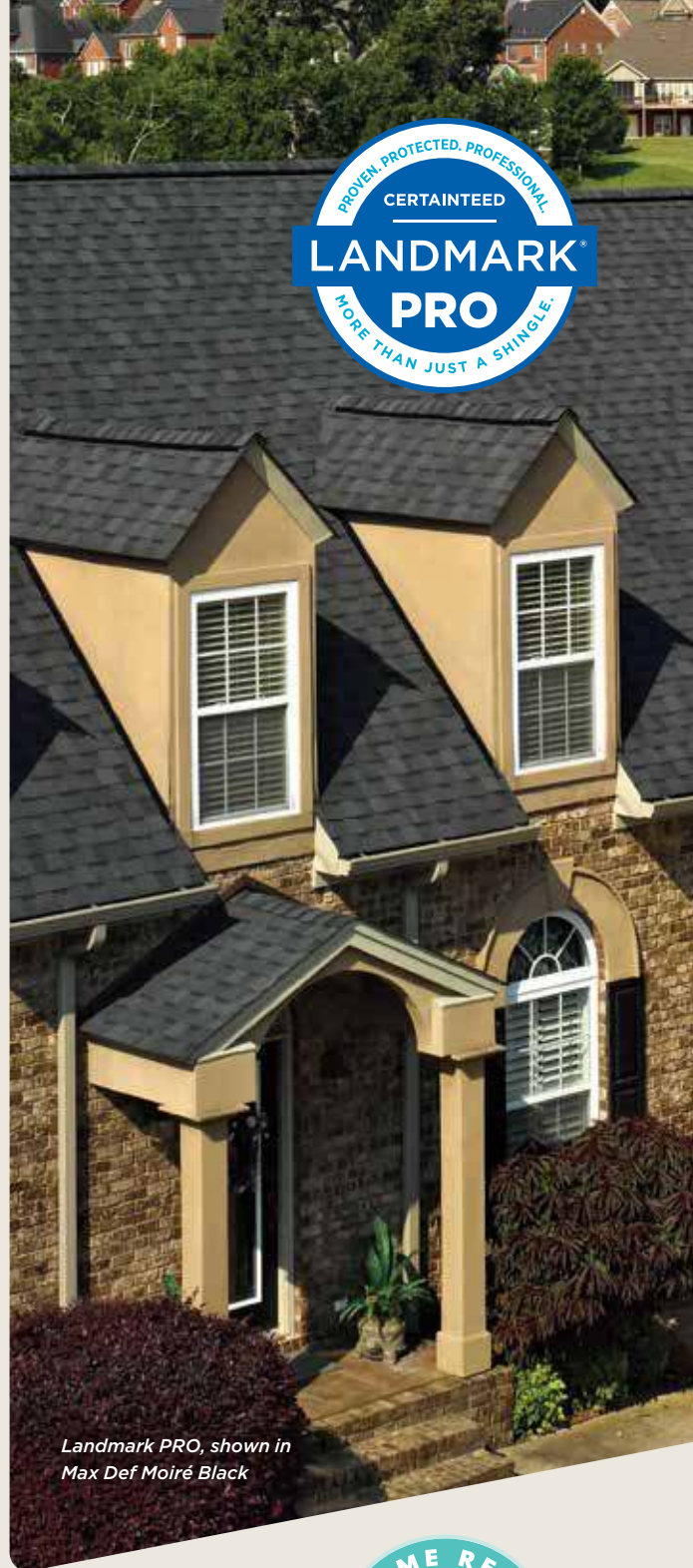
Landmark PRO, shown in Max Def Moiré Black