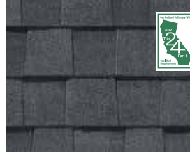
Solaris Moiré Black CRRC Product ID 0668-0129