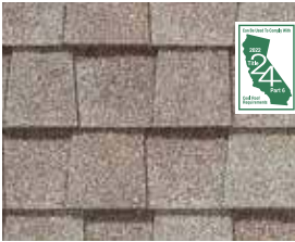
Solaris Mojave Tan CRRC Product ID 0668-0115