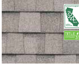
Solaris Mist White CRRC Product ID 0668-0071