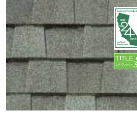
Solaris Georgetown Gray CRRC Product ID 0668-0116