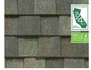
Solaris Weathered Wood CRRC Product ID 0668-0119