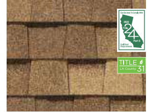
Solaris Resawn Shake CRRC Product ID 0668-0118