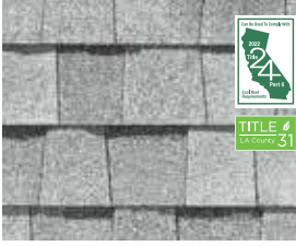
Solaris Silver Birch CRRC Product ID 0668-0072