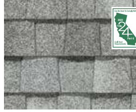
Solaris Birchwood CRRC Product ID 0668-0084