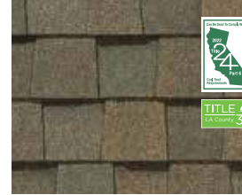
Solaris Heather Blend CRRC Product ID 0668-0117