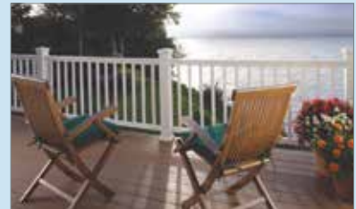
Decking and Railing