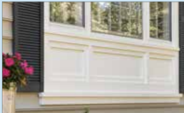
PVC Exterior Trim & Beadboard