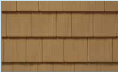
Polymer Shakes & Shingles