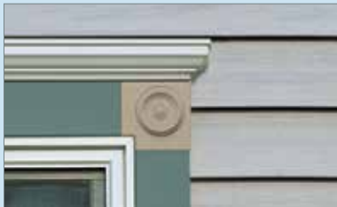
Vinyl Carpentry® Trim