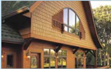
Fiber Cement Siding