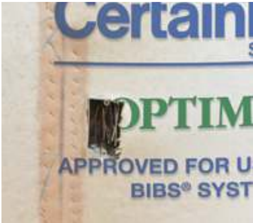
BIBS with OPTIMA completely surrounds electrical boxes to help prevent costly drafts and cold spots.

OPTIMA improves energy efficiency and reduces energy consumption. It is also LEED® eligible, as are a number of other CertainTeed insulation products. You can earn credits under LEED and similar green building rating systems.