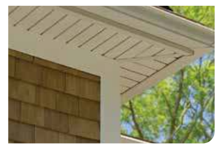
VINYL & METAL SOFFIT