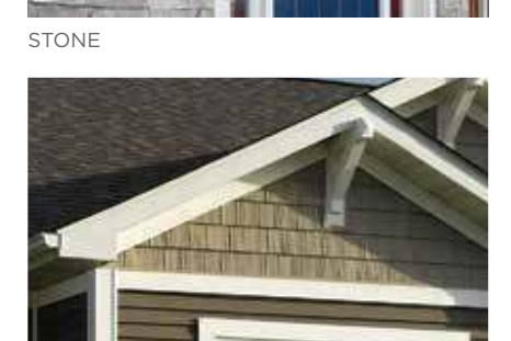
VINYL CARPENTRY® TRIM