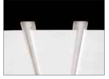
InvisiVent Triple 3-1/3"

Hidden vents provide a smooth, flat non-perforated surface versus most vented soffits with unsightly perforations.