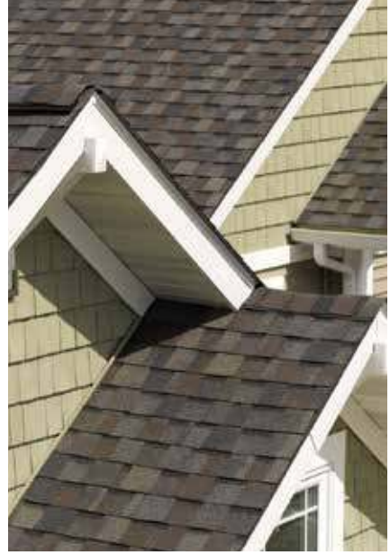
ROOFING AND VENTILATION