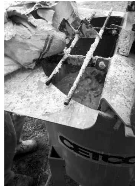
Mixing BENTOGROUT in CETCO mixer.

Limitations: BENTOGROUT is not designed to bridge cracks or gaps larger than 3 mm (1/8"). Interior surface cracks greater than 3 mm (1/8") should be surface sealed with cement based patching material to prevent grout extrusion into the structure. BENTOGROUT is not designed as a structural patch. BENTOGROUT is not recommended for above grade or applications that do not provide proper confinement. BENTOGROUT is not suitable for sealing expansion joints.