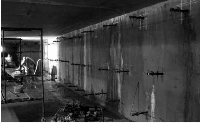
INTERIOR SURFACE GROUT INJECTION: BENTOGROUT is applied to the inside of the building without excavating the site.