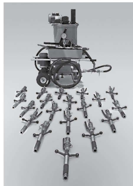
CETCO BENTOGROUT Pump, Mixer and Accessories.

Caution: Pumping any material under pressure can cause lifting or movement of adjacent structures.