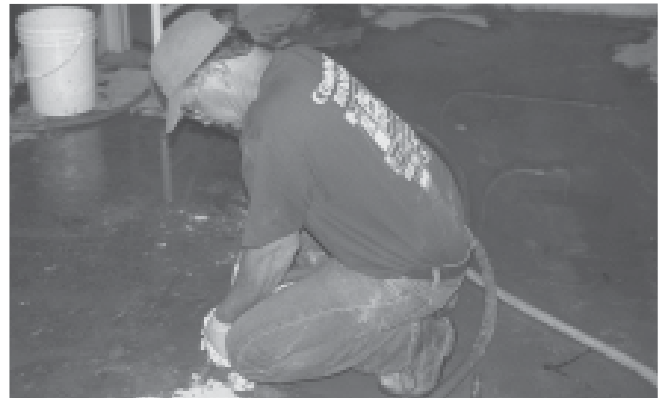
STRUCTURAL SLAB APPLICATION: Inject BENTOGROUT under an existing slab to provide waterproofing and fill void areas.