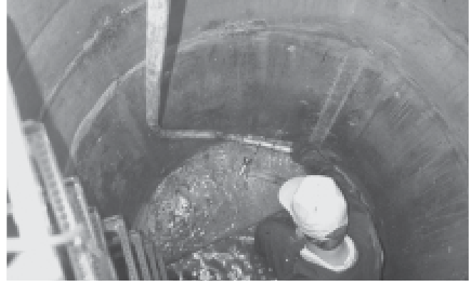
INTERIOR THROUGH WALL APPLICATION: BENTOGROUT injected to the exterior of a manhole through pre-drilled holes using a short injection wand.