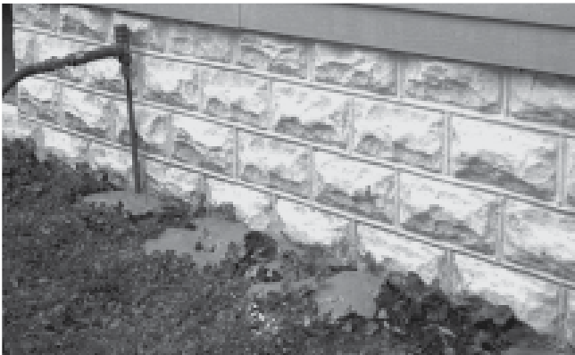
EXTERIOR MASONRY WALL APPLICATION: Inject BENTOGROUT along the exterior of a foundation wall at 24" (600 mm) on center intervals.