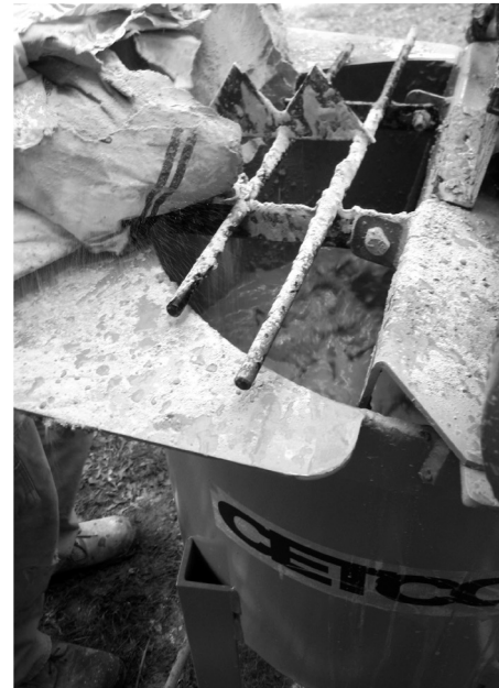
Mixing BENTOGROUT in CETCO mixer.

Limitations: BENTOGROUT is not designed to bridge cracks or gaps larger than 3 mm (1/8"). Interior surface cracks greater than 3 mm (1/8") should be surface sealed with cement based patching material to prevent grout extrusion into the structure. BENTOGROUT is not designed as a structural patch. BENTOGROUT is not recommended for above grade or applications that do not provide proper confinement. BENTOGROUT is not suitable for sealing expansion joints.