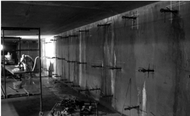
INTERIOR SURFACE GROUT INJECTION: BENTOGROUT is applied to the inside of the building without excavating the site.