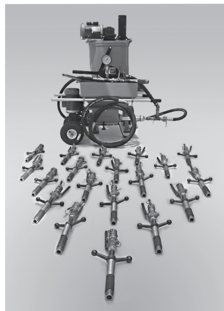
CETCO BENTOGROUT Pump, Mixer and Accessories.

Caution: Pumping any material under pressure can cause lifting or movement of adjacent structures.