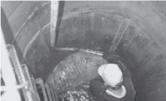
INTERIOR THROUGH WALL APPLICATION: BENTOGROUT injected to the exterior of a manhole through pre-drilled holes using a short injection wand.