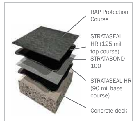
215-mil Thick reinforced membrane

EXPANSION JOINTS: Expansion joints shall be sealed with proper expansion joint material, as approved by the project engineer, compatible with hot rubberized asphalt waterproofing membrane. Contact membrane manufacturer for expansion joint detailing illustrations to address specific project conditions.