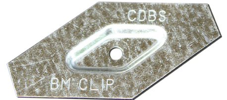
(BM-Clip) Barrier Mesh™ Clip 2.75" long x 1.5" wide high-strength steel clips used to attach Barrier Mesh to framing studs. 300 clips/carton