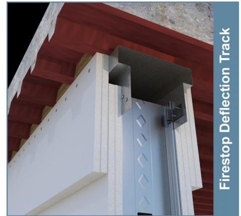
Firestop Deflection Track