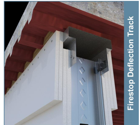
Firestop Deflection Track