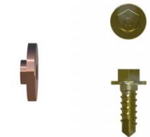
FastClip Deflection Screw Copper Bushing is for 14ga Clip