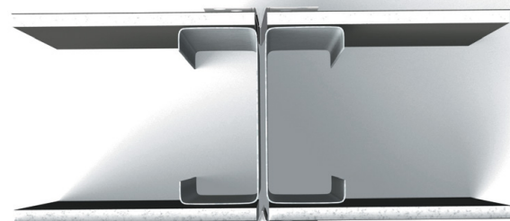
1 Hour Fire Rating (1) 5/8" Type "X" Drywall on each side