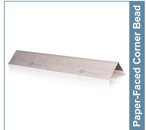
Paper-Faced Corner Bead