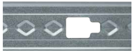
ProSTUD Drywall Framing

Smart Edge does not eliminate all risks of cuts and scrapes. ClarkDietrich always recommends the use of appropriate Personal Protective Equipment (PPE), including but not limited to gloves and arm guards, for all trade personnel who come in contact with cold-formed steel framing.