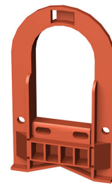
Spazzer Snap-in Grommet