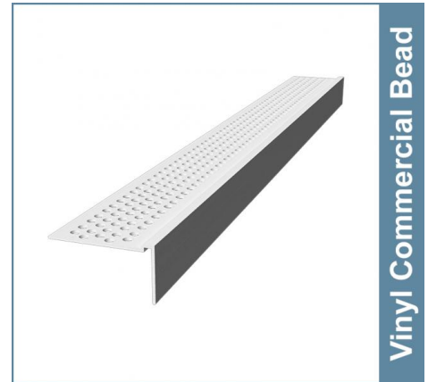
Vinyl Commercial Bead