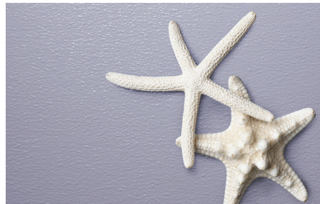
THE KEYS COLLECTION