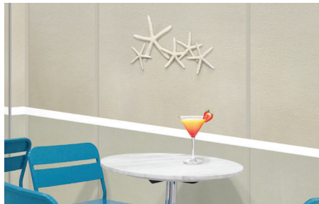
THE SANDS COLLECTION