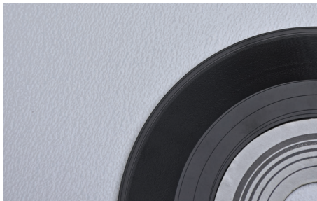
THE CLASSICS COLLECTION

Look at our other collections for more color options.