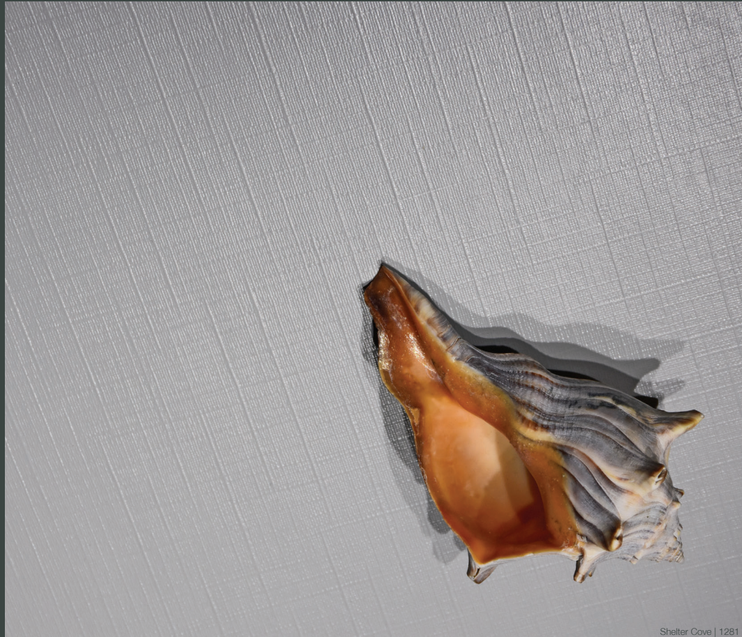
Shelter Cove | 1281