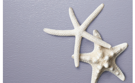
THE KEYS COLLECTION