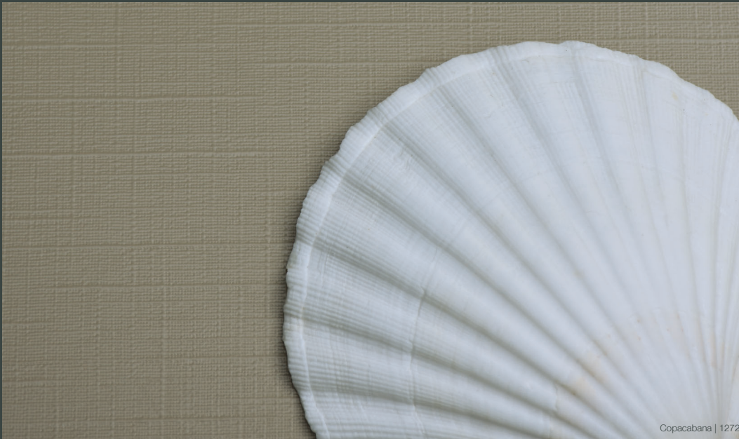
Copacabana | 1272