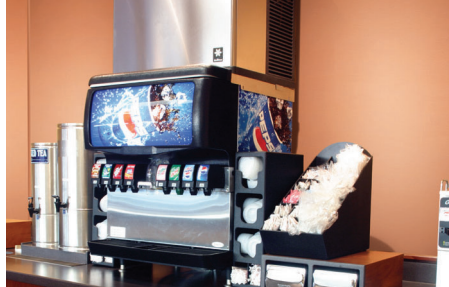
THE PARKS COLLECTION