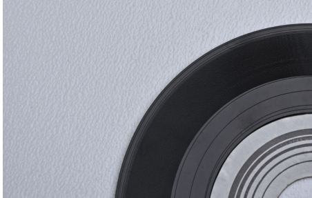
THE CLASSICS COLLECTION

Look at our other collections for more color options.