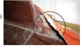
FIGURE 10. AVOID POST INSTALLATION ADDITIONS

Avoid post installation additions, such as ceramic tile base directly over the FRP panel. Such additions restrict expansion space of the panel. (Figure 10)