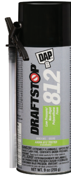
DAP® DRAFTSTOP® 812 Window and Door Foam