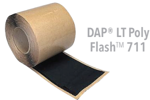
DAP® LT Poly Flash™ 711