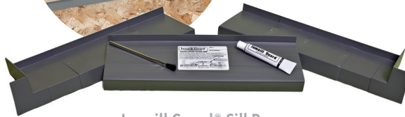
Jamsill Guard® Sill Pan