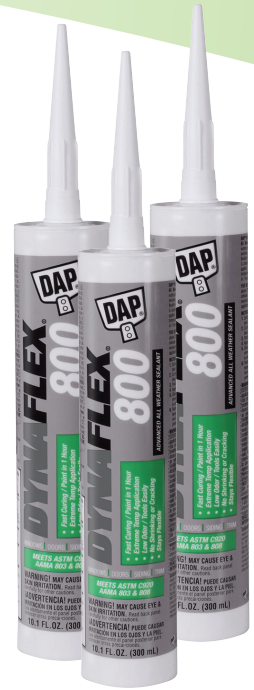
DAP® DYNAFLEX® 800 Sealant