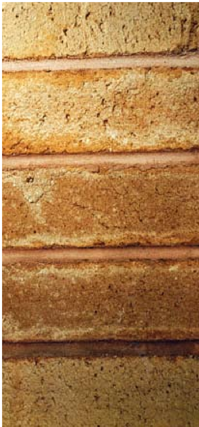
Fig. 3. In this example, a masonry prism was constructed using one batch of mortar. The top mortar joint was tooled immediately after placement of the unit. Remaining mortar joints were tooled at progressively greater time intervals and thus stiffer consistency. The relationship between mortar consistency when tooled and mortar color is quite apparent.

The effect of tooling on the appearance of a mortar joint is dependent on the type of jointer used and the stiffness of the mortar at the time it is tooled. Tooling of mortar when it is highly plastic or flowable will tend to pull a high-water-content paste to the surface, resulting in a porous light-colored joint surface. If the mortar is allowed to become stiff before tooling, the joint surface will not readily yield to the pressure of the jointer, and friction developing between the metal jointer and the mortar joint will result in a dark streaked surface. When tooled at the proper consistency, the surface of the mortar joint is compacted, and a uniform appearance consistent with the body of the mortar is achieved.