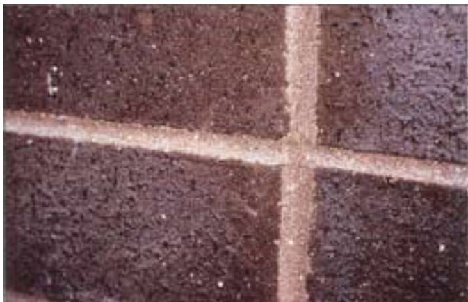
Fig. 4. The use of a strong acid cleaning solution has etched the surface of these mortar joints, exposed sand particles, and significantly changed the appearance of the mortar joint.

Cleaning. Cleaning procedures often completely alter the appearance of a mortar joint, changing both texture and color. Most cleaning techniques are designed to remove mortar droppings or smears from the surface of newly constructed masonry. However, if these techniques dissolve the cement paste from the surface of a mortar joint, the appearance of that joint is no longer dominated by the color of the hardened cement paste, but reflects the appearance of sand particles that are exposed on the surface. The effect of improper cleaning is most dramatic on colored mortar joints, since the pigmented cement paste is relied upon in these systems to produce the desired color. In addition to altering the appearance of mortar joints, improper cleaning may damage masonry units and compromise the ability of the masonry to resist water penetration.