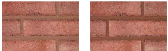
(b) Different intensities, same hue and shade