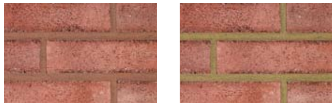
(a) Different hues, same intensity and shade