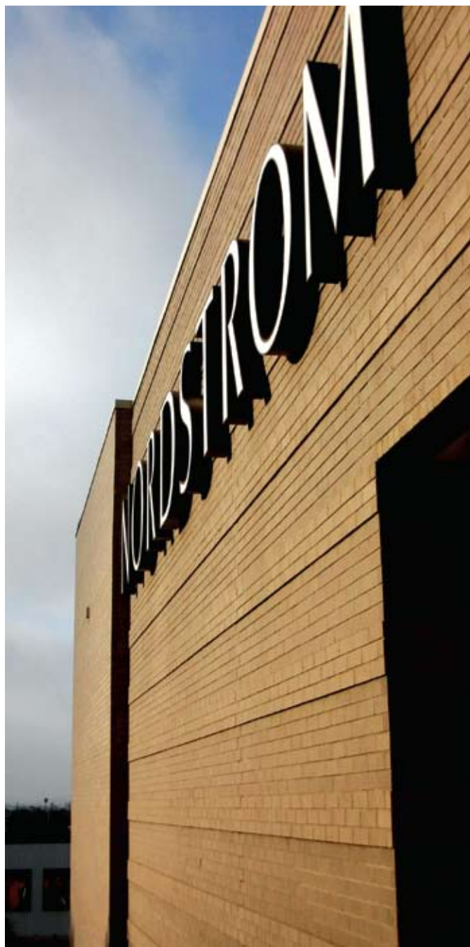
Fig. 6. With care and cooperation, consistent mortar color producing the appearance desired by the owner can be achieved.

View with Pride. It was noted at the beginning of this article that an appreciation for the inherent beauty of masonry is often the reason it is selected by the owner as a building component. Hopefully, that appreciation of masonry is shared by the mason contractor and his crew and will motivate each person to do his part to assure that the finished project is one in which all can take pride.