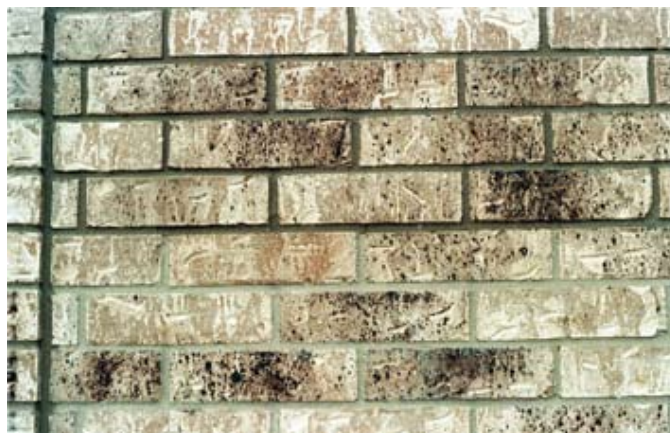
Fig. 5. The difference in mortar color in this example was determined to be the result of a change in both sand and type of cement used in the mortar.

Use the Same Mortar Materials. Changes in brands of masonry cement, mortar cement, portland cement, hydrated lime, or pigments during construction of a project should be avoided. All of the sand should be from the same source. When multiple sand shipments are required, the mason contractor should visually check the appearance of successive shipments to assure that sand color and gradation has not changed significantly. For jobs having particularly demanding requirements on mortar color, it may be advisable to keep a small quantity of sand from the first shipment in a sealed container for comparison with subsequent shipments.