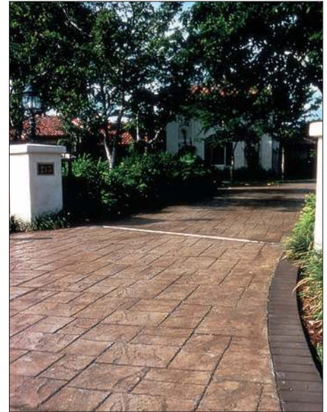
Pattern stamping and colored release agents are applied to integrally colored concrete for unique effects.