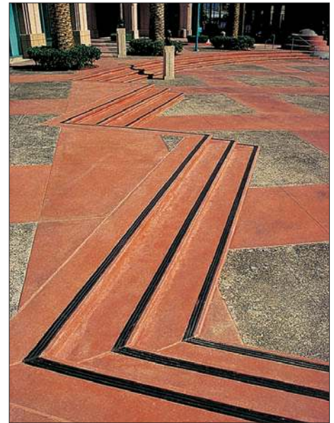
Integral color adds a design dimension to otherwise ordinary concrete.