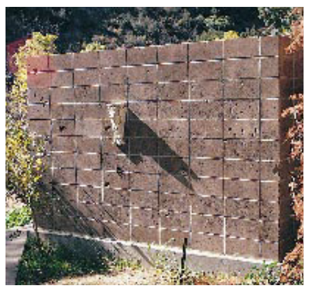
Davis can fine-tune colors to help create a unique product difference.

Contact Davis Colors for complete product specifications and to discuss whether a liquid-based, granulated or dry powder pigment system best suits your production requirements.