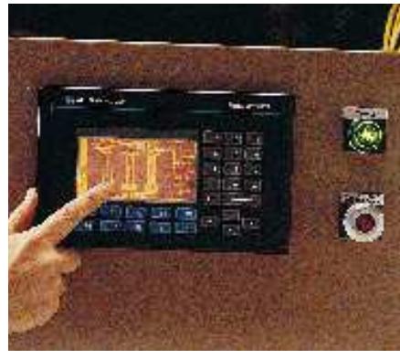
Dispenser control stores recipes and is adaptable to your operation.

Hydrotint® slurries have been care-fully formulated for high pigment content and improved flowability vs. competitive slurries to provide accurate metering and faster production.