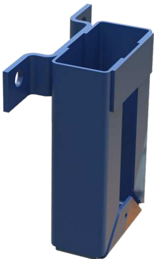
C-52 Bridge Overhang Guard Rail Receptacle

The C52 Guardrail Receptacle is designed to facilitate placement of guardrail posts on the exterior formwork. The C52 receptacle bolts securely to the C54 Bridge Overhang Bracket Extender and accepts 2x4 guardrail posts.