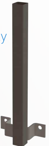
C-52 Guardrail Speed Bracket Assembly

The C52P Guardrail Speed Bracket Assembly is designed for fast and easy attachment to the C49 Bridge Overhang Bracket. The C52P's Speed Bracket bolts securely to the C49 Bridge Overhang Bracket and provides a base to simply install the Guardrail Post. The Guardrail Post has a nail down feature to prevent uplift. The C52P is compatible with lumber or cable railings.