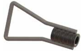
F65LF Ferrule Insert